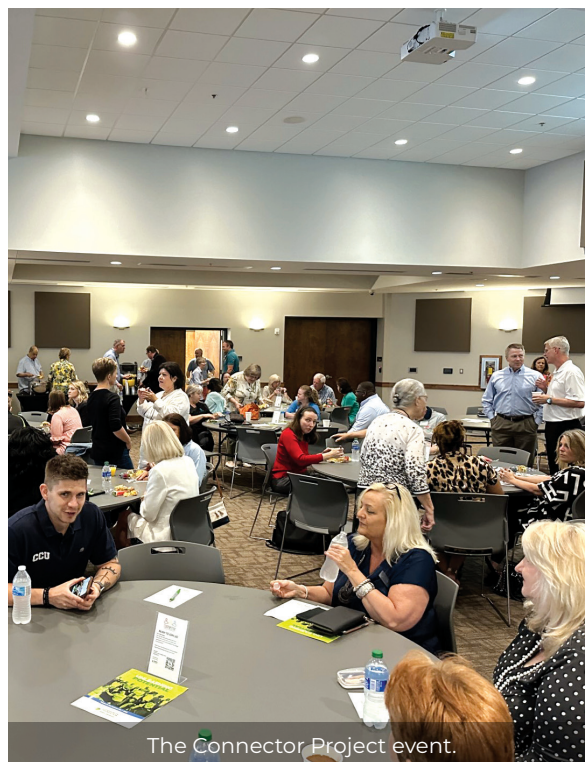
The Connector Project event.

The Connector project represents a significant step forward in connecting nonprofit organizations to the individuals who need their services. This initiative holds the potential to transform the way nonprofits operate by streamlining access, providing an efficient matching system, enhancing outreach, fostering collaboration, and utilizing data-driven insights. As The Connector bridges the gap, it empowers nonprofits to ensure the right services are readily available to the individuals who need them, ultimately creating a more connected and compassionate society.